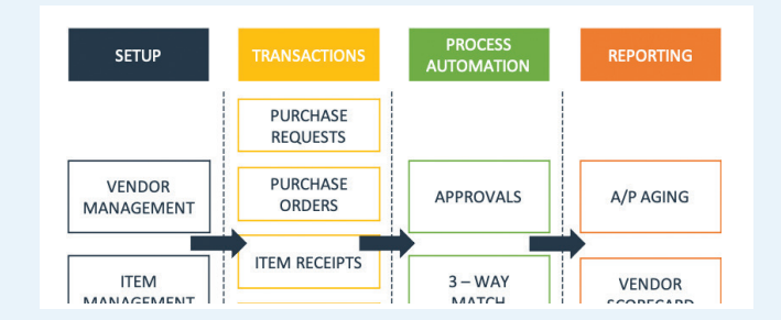
CHART OF ACCOUNTS

From a procurement standpoint, regardless of if a Hi-Tech company orders and tracks physical inventory or manages procurement from a non-inventory / expense standpoint, the purchase requisition and purchase order process can be leveraged. If there is no need for purchase orders, the procurement process will begin with a standalone vendor bill.